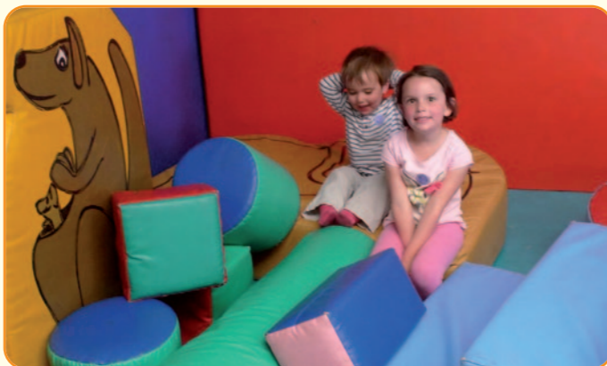
Timprint Ltd, Armagh

Don't miss this fun opportunity for your child to interact and engage with peers.